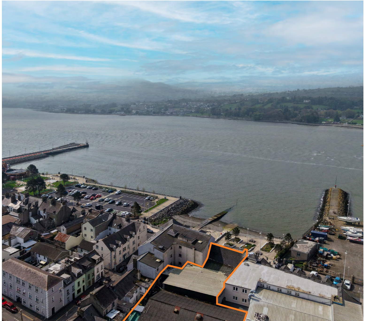
Property outline for indicative purposes only

Under NI Small Business Rate Relief, business properties with a NAV of more than £5,000 but not more than £15,000 should receive a 20% rate relief.